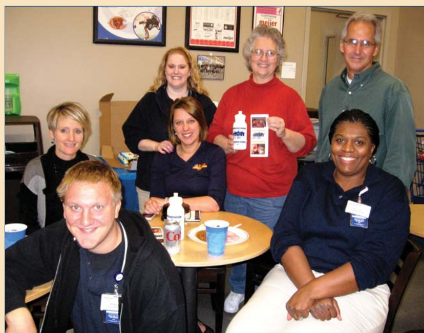
Members at Meijer #251 in Stevensville and Rite Aid #4239 in Coloma enjoy the free lunch they won in the 2011 UFCW 951 Foundation Sign-Up Drive. Both units had the highest sign-up in their region.

Members at nine units, three in each of the UFCW's geographic regions, are being recognized at special luncheons for their outstanding participation in the UFCW 951 Foundation's membership sign-up drive.