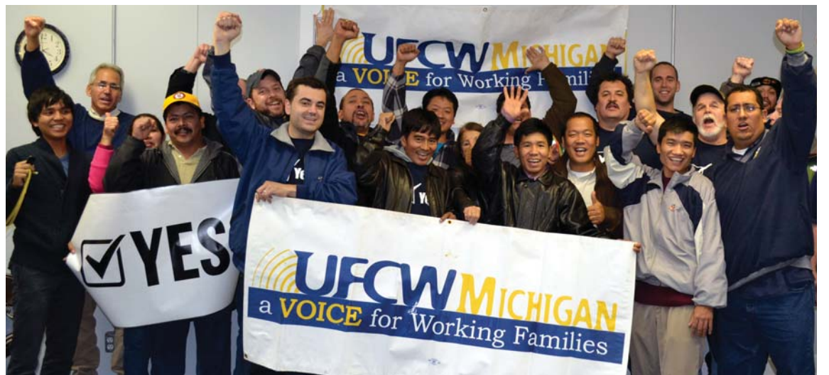
Chanting, "What Time is it? Union Time!" JBS workers and UFCW organizers celebrate after the successful conclusion to their union organizing campaign. The over 1,000 workers at the Plainwell slaughterhouse and production facility overwhelmingly voted for UFCW 951 representation in October.

With over 1,000 workers at the plant, the JBS win