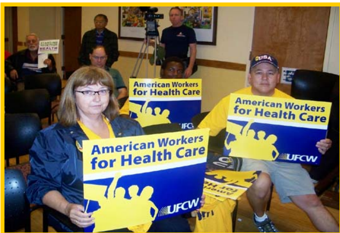
Pictured above, Local 5 members at a town hall meeting this past weekend with Congressman Pete Stark (D-CA).