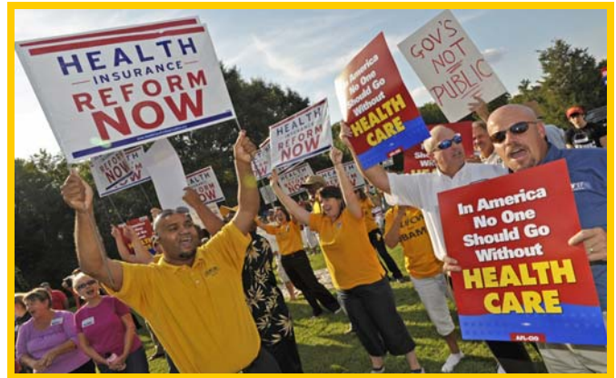
UFCW Locals 27 and 1994 participated in a rally in Centerville, Md., to reiterate the urgency of health care reform. OP

As part of the effort to push for health care reform, a new tool ‘Click to Call’ is now available to make it easier to connect with your Senator. Go to www.ufcwactnow.org , fill out the online form, and read the tips on what to say when you call. UFCW Act Now will then directly connect you with your Senator's office by phone. There is even a place to report back what kind of response you received from your call. OP