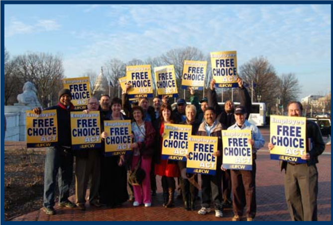
UFCW members appeared at a Senate hearing on Employee Free Choice. The bill was introduced in the House and Senate this afternoon.

Dozens of UFCW members from UFCW Locals 1994, 27, and 400 were at the Capitol today as the Employee Free Choice Act was introduced in the House and Senate. Members traveled to Washington to appear at a Senate Health, Education, Labor and Pensions (HELP) Committee hearing entitled, Rebuilding Economic Security: Empowering Workers to Restore the Middle Class . After the hearing, Senator Harkin (D-IA) and Representative Miller (D-CA) introduced the bill in each chamber of Congress.